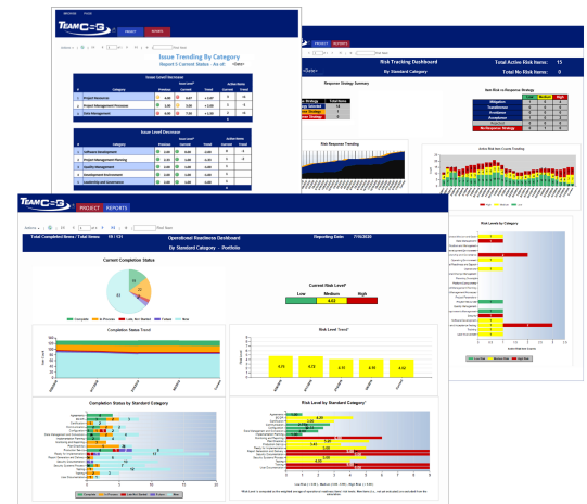
TeamCSG SM Project Management and TeamCSG SM Operational Readiness

Provides a collaboration tool that provides a comprehensive baseline set of Business Process Models, captures and centrally stores all MITA SS-A project data, and features "push-button" generation of all of the CMS-required reports and formats.