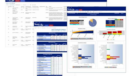
TeamCSG<sup>™</sup> Risk Assessment Tracking and Reporting

Provides the ability to capture and track risks, observations, and recommendations across all assessment efforts and to determine increasing or decreasing risk levels and project health not only at an item level, but a configurable real-time management reports reflecting the status of all project risks, as we