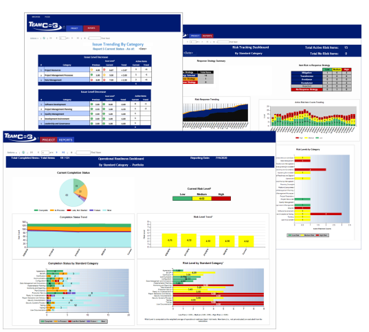
TeamCSG<sup>SM</sup> Project Management and TeamCSG<sup>SM</sup> Operational Readiness

Provides a requirements repository that supports capturing and approving business and technical requirements and traceability to multiple RFPs, contracts, and ultimately to the deployed solutions.